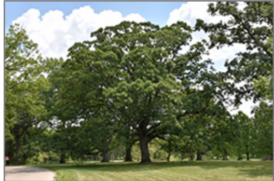
White Oak