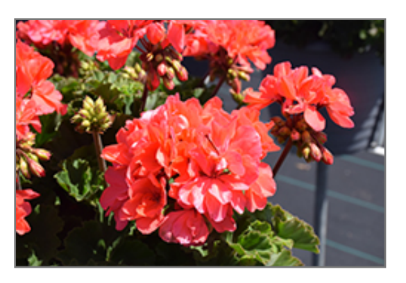
Mojo Salmon Geranium flowers