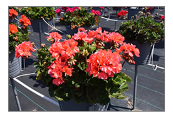
Mojo Salmon Geranium in bloom

42W075 IL Route 38, Elburn, IL. 60119 countrysideflowershop.com