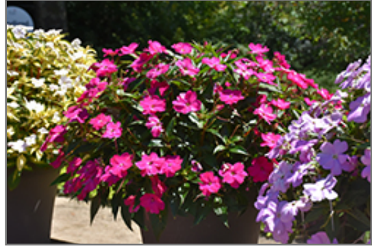
SunPatiens Vigorous Rose Pink New Guinea Impatiens in bloom

SunPatiens Vigorous Rose Pink New Guinea Impatiens is a fine choice for the garden, but it is also a good selection for planting in outdoor containers and hanging baskets. Because of its height, it is often used as a 'thriller' in the 'spiller-thriller-filler' container combination; plant it near the center of the pot, surrounded by smaller plants and those that spill over the edges. It is even sizeable enough that it can be grown alone in a suitable container. Note that when growing plants in outdoor containers and baskets, they may require more frequent waterings than they would in the yard or garden.