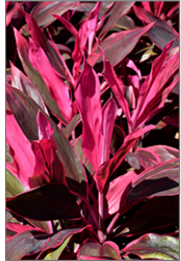
Red Sister Hawaiian Ti Plant foliage

There are many factors that will affect the ultimate height, spread and overall performance of a plant when grown indoors; among them, the size of the pot it's growing in, the amount of light it receives, watering frequency, the pruning regimen and repotting schedule. Use the information described here as a guideline only; individual performance can and will vary. Please contact the store to speak with one of our experts if you are interested in further details concerning recommendations on pot size, watering, pruning, repotting, etc.