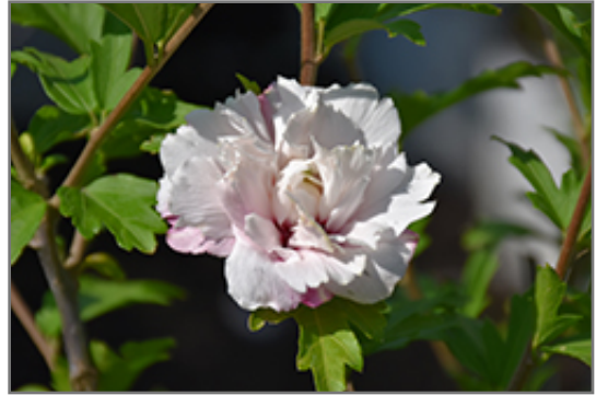
French Cabaret Blush Rose of Sharon flowers