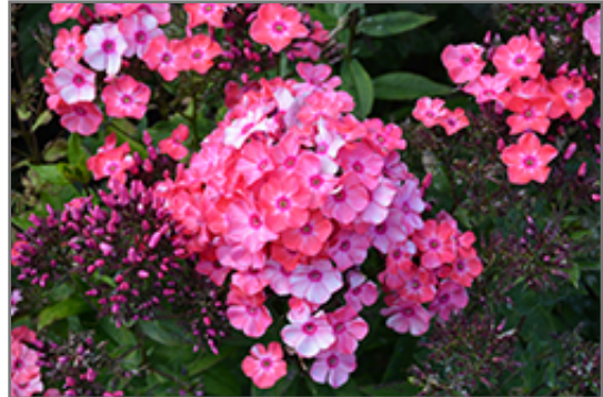
Garden Girls Glamour Girl Garden Phlox flowers