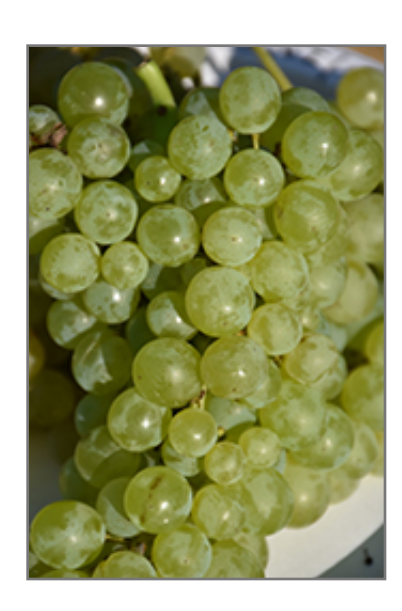
Himrod Grape fruit

Aside from its primary use as an edible, Himrod Grape is sutiable for the following landscape applications;