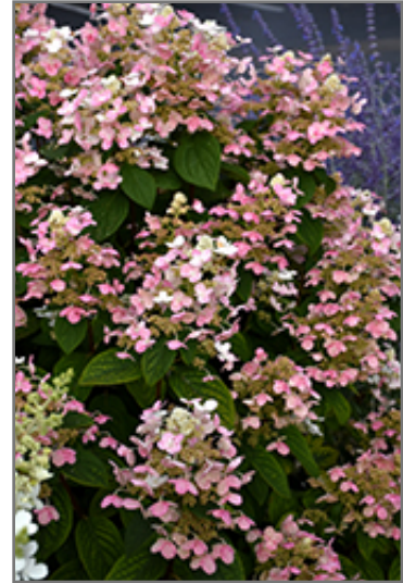
Quick Fire Hydrangea flowers