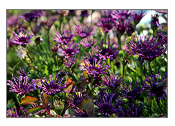
FlowerPower Spider Purple African Daisy flowers