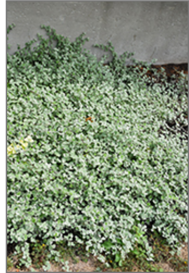
Silver Licorice Plant

Silver Licorice Plant is a fine choice for the garden, but it is also a good selection for planting in outdoor containers and hanging baskets. Because of its trailing habit of growth, it is ideally suited for use as a 'spiller' in the 'spiller-thriller-filler' container combination; plant it near the edges where it can spill gracefully over the pot. Note that when growing plants in outdoor containers and baskets, they may require more frequent waterings than they would in the yard or garden.