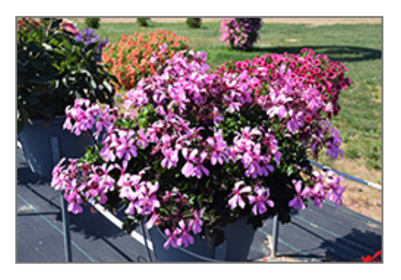
Caldera Pink Geranium in bloom

42W075 IL Route 38, Elburn, IL. 60119 countrysideflowershop.com