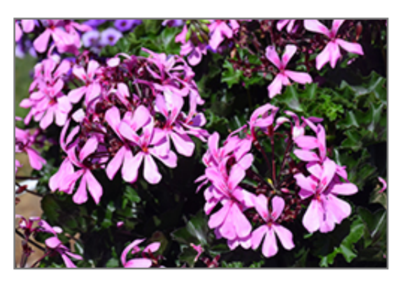
Caldera Pink Geranium flowers