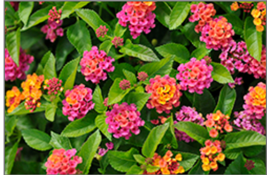
Bloomify Rose Lantana flowers

Bloomify Rose Lantana is recommended for the following landscape applications;