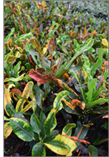
Mammy Croton in full

When grown indoors, Mammy Croton can be expected to grow to be about 3 feet tall at maturity, with a spread of 4 feet. It grows at a medium rate, and under ideal conditions can be expected to live for approximately 10 years. This houseplant will do well in a location that gets either direct or indirect sunlight, although it will usually require a more brightly-lit environment than what artificial indoor lighting alone can provide. It does best in average to evenly moist soil, but will not tolerate standing water. The surface of the soil shouldn't be allowed to dry out completely, and so you should expect to water this plant once and possibly even twice each week. Be aware that your particular watering schedule may vary depending on its location in the room, the pot size, plant size and other conditions; if in doubt, ask one of our experts in the store for advice. It is not particular as to soil pH, but grows best in rich soil. Contact the store for specific recommendations on pre-mixed potting soil for this plant. Be warned that parts of this plant are known to be toxic to humans and animals, so special care should be exercised if growing it around children and pets.