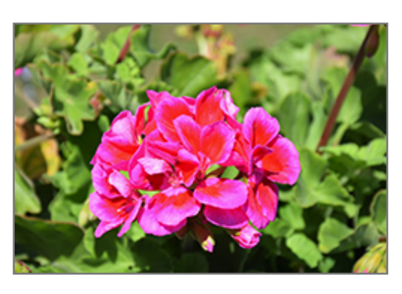
Calliope Large Lavender Mega Splash Geranium flowers