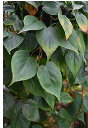
Jade Pothos foliage