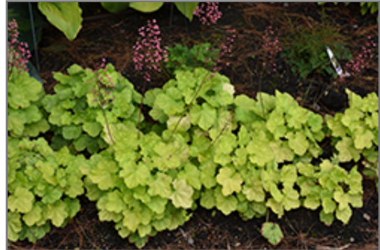
Primo Pretty Pistachio Coral Bells

Primo Pretty Pistachio Coral Bells will grow to be about 10 inches tall at maturity extending to 22 inches tall with the flowers, with a spread of 28 inches. When grown in masses or used as a bedding plant, individual plants should be spaced approximately 26 inches apart. Its foliage tends to remain low and dense right to the ground. It grows at a medium rate, and under ideal conditions can be expected to live for approximately 10 years. As an evergreen perennial, this plant will typically keep its form and foliage year-round.