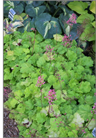
Primo Pretty Pistachio Coral Bells in bloom

Primo Pretty Pistachio Coral Bells is recommended for the following landscape applications;