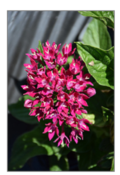
Starcluster Violet Star Flower flowers

Starcluster Violet Star Flower features showy corymbs of violet star-shaped flowers with rose overtones and lavender eyes at the ends of the stems from late spring to early fall. Its large textured pointy leaves remain forest green in color throughout the year.