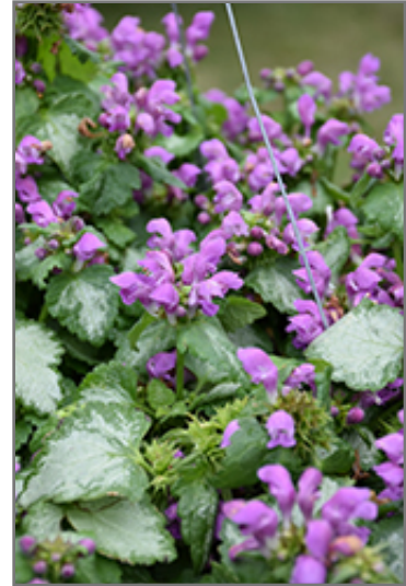
Purple Chablis Spotted Dead Nettle flowers