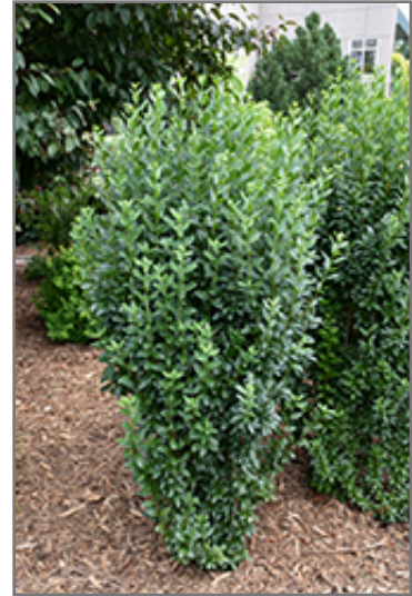
Straight Talk Privet