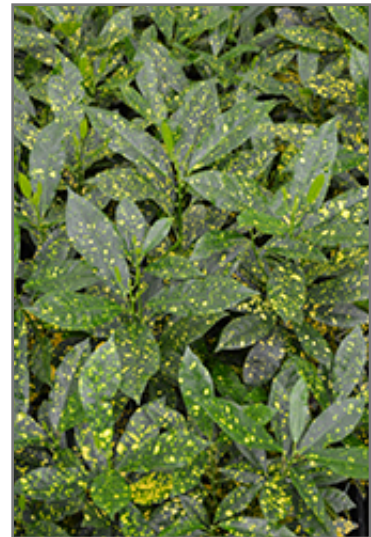
Gold Dust Variegated Croton foliage