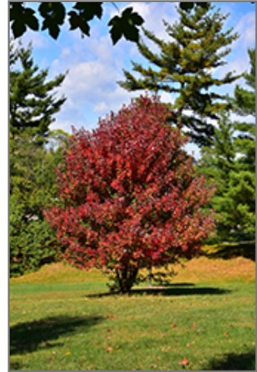
Redpointe Red Maple in fall

This tree should only be grown in full sunlight. It is quite adaptable, preferring to grow in average to wet conditions, and will even tolerate some standing water. It is not particular as to soil type, but has a definite preference for acidic soils, and is subject to chlorosis (yellowing) of the foliage in alkaline soils. It is somewhat tolerant of urban pollution. This is a selection of a native North American species.