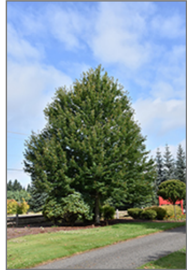
Redpointe Red Maple