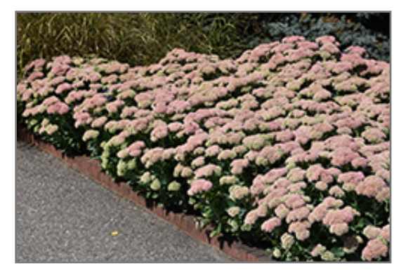
Autumn Joy Stonecrop in bloom