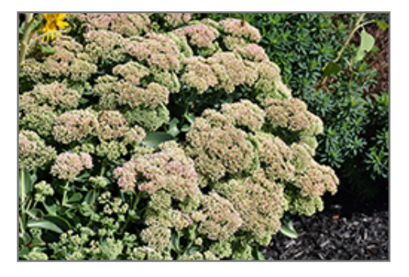
Autumn Joy Stonecrop in bloom