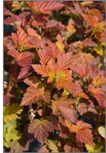
Amber Jubilee Ninebark foliage

Amber Jubilee Ninebark is recommended for the following landscape applications;