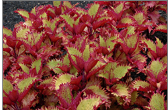
Henna Coleus foliage