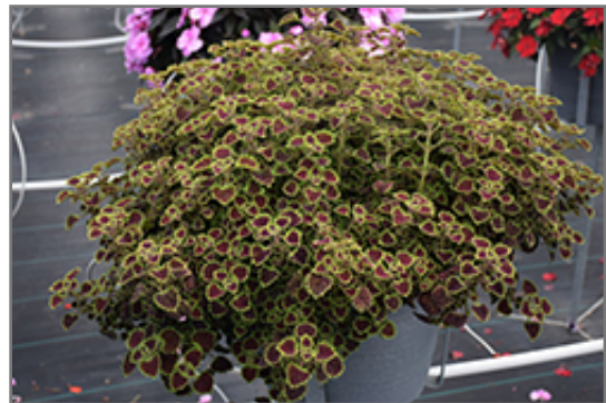
Burgundy Wedding Train Coleus