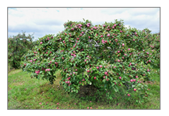
Macintosh Apple fruit

This tree is typically grown in a designated area of the yard because of its mature size and spread. It should only be grown in full sunlight. It prefers to grow in average to moist conditions, and shouldn't be allowed to dry out. It is not particular as to soil type or pH. It is highly tolerant of urban pollution and will even thrive in inner city environments. This particular variety is an interspecific hybrid.