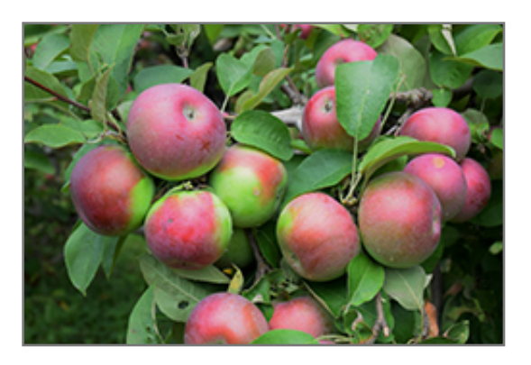
Macintosh Apple fruit

Macintosh Apple features showy clusters of lightly-scented white flowers with shell pink overtones along the branches in mid spring, which emerge from distinctive pink flower buds. It has forest green deciduous foliage. The pointy leaves turn yellow in fall. The fruits are showy red apples with hints of light green, which are carried in abundance in early fall. The fruit can be messy if allowed to drop on the lawn or walkways, and may require occasional clean-up.