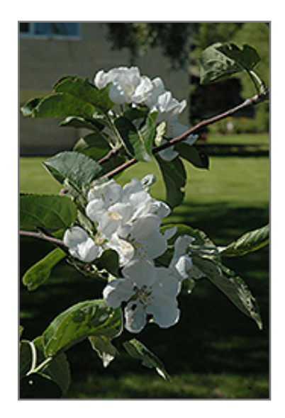
Macintosh Apple flowers