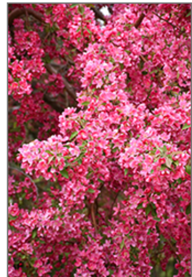
Prairifire Flowering Crab flowers