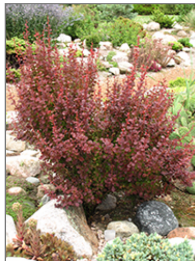
Orange Rocket Japanese Barberry

This shrub does best in full sun to partial shade. It is very adaptable to both dry and moist growing conditions, but will not tolerate any standing water. It is considered to be drought-tolerant, and thus makes an ideal choice for xeriscaping or the moisture-conserving landscape. It is not particular as to soil type or pH, and is able to handle environmental salt. It is highly tolerant of urban pollution and will even thrive in inner city environments. This is a selected variety of a species not originally from North America.