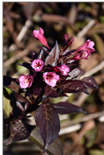
Fine Wine Weigela flowers