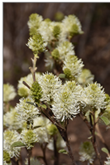
Mt. Airy Fothergilla flowers