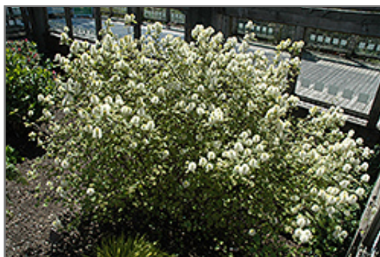
Mt. Airy Fothergilla in bloom