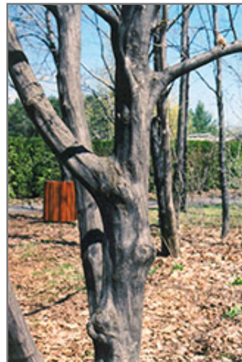
American Hornbeam bark

This tree performs well in both full sun and full shade. It is an amazingly adaptable plant, tolerating both dry conditions and even some standing water. It is not particular as to soil type or pH. It is somewhat tolerant of urban pollution. This species is native to parts of North America.