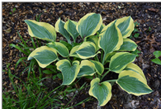
Liberty Hosta