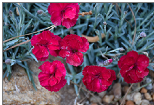
Frosty Fire Pinks flowers