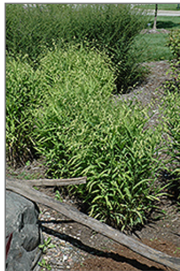
Northern Sea Oats