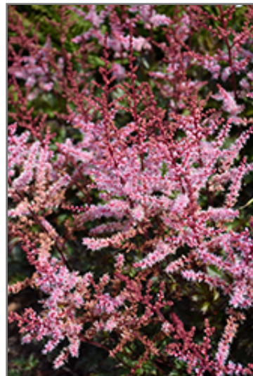
Delft Lace Astilbe flowers

Delft Lace Astilbe is recommended for the following landscape applications;