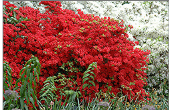
Stewartstonian Azalea in bloom