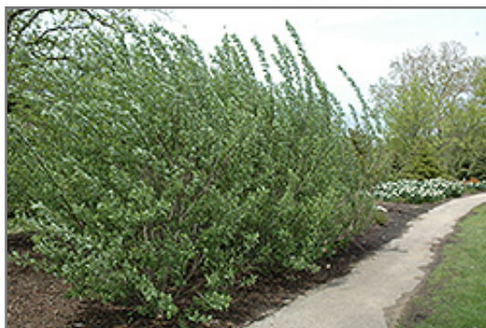
French Pussy Willow