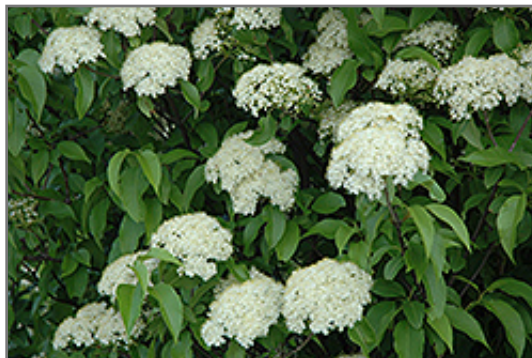
Nannyberry flowers