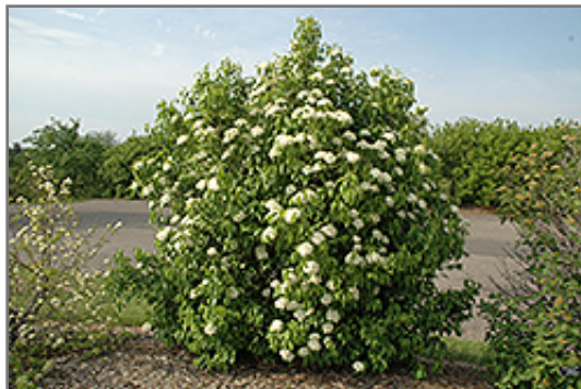
Nannyberry in bloom