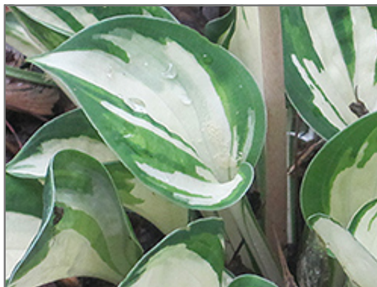
Pandora's Box Hosta foliage

Pandora's Box Hosta is recommended for the following landscape applications;