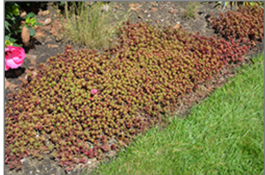
Fulda Glow Stonecrop