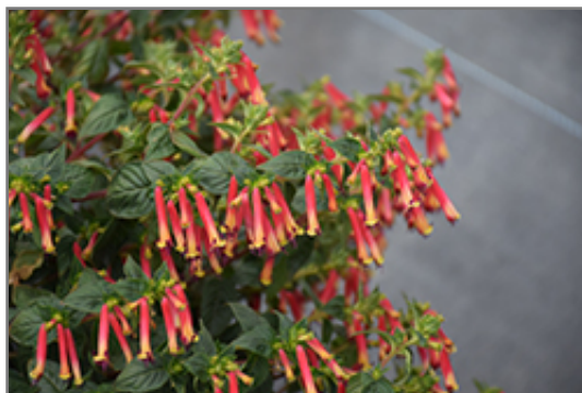
Hummingbird's Lunch Cuphea flowers