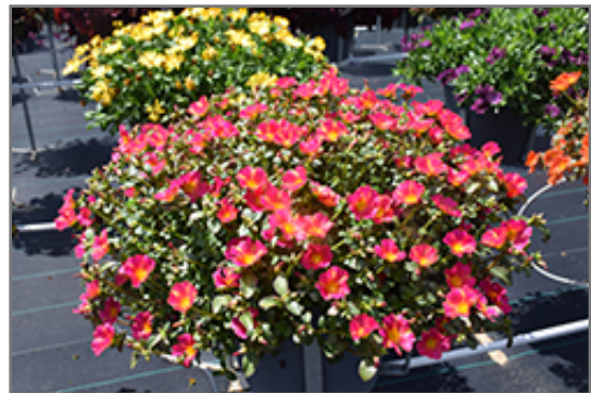
Mega Pazzaz Pink Twist Portulaca in bloom