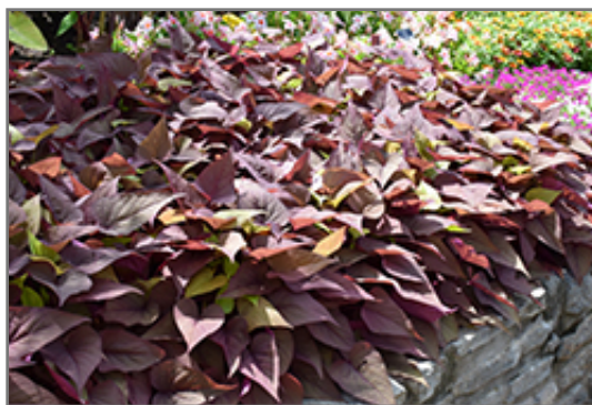
Sweet Georgia Heart Red Sweet Potato Vine