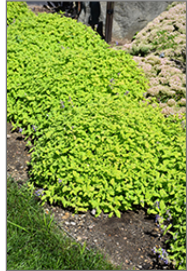
Chartreuse On The Loose Catmint

Chartreuse On The Loose Catmint is recommended for the following landscape applications;