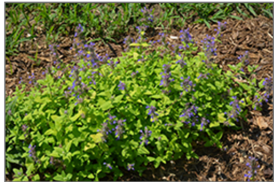
Chartreuse On The Loose Catmint in bloom