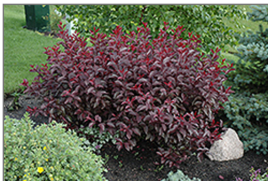
Purpleleaf Sandcherry