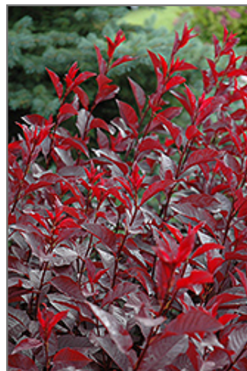
Purpleleaf Sandcherry foliage