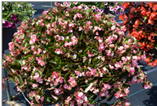
Hula Pink Begonia in bloom

Hula Pink Begonia is a fine choice for the garden, but it is also a good selection for planting in outdoor containers and hanging baskets. Because of its spreading habit of growth, it is ideally suited for use as a 'spiller' in the 'spiller-thriller-filler' container combination; plant it near the edges where it can spill gracefully over the pot. Note that when growing plants in outdoor containers and baskets, they may require more frequent waterings than they would in the yard or garden.