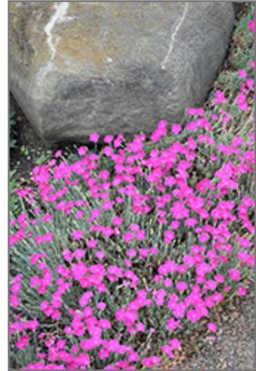
Firewitch Pinks in bloom

Firewitch Pinks is a fine choice for the garden, but it is also a good selection for planting in outdoor pots and containers. It is often used as a 'filler' in the 'spiller-thriller-filler' container combination, providing a mass of flowers and foliage against which the thriller plants stand out. Note that when growing plants in outdoor containers and baskets, they may require more frequent waterings than they would in the yard or garden.