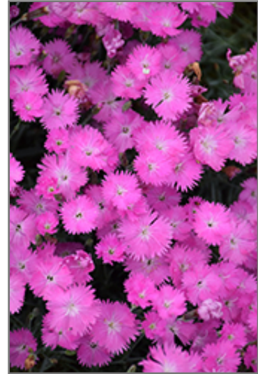
Firewitch Pinks flowers

Firewitch Pinks is recommended for the following landscape applications;