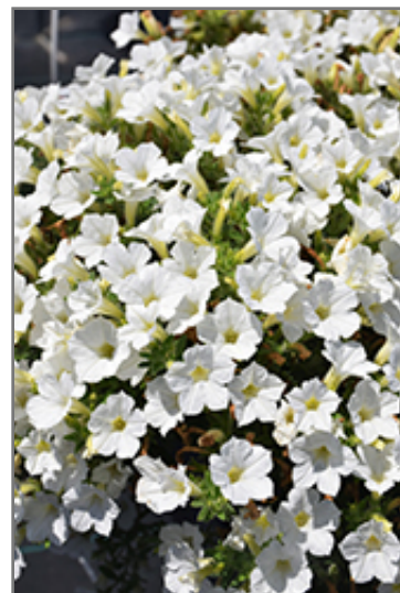
Itsy White Petunia flowers

Itsy White Petunia is recommended for the following landscape applications;