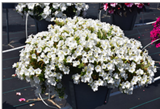
Itsy White Petunia in bloom