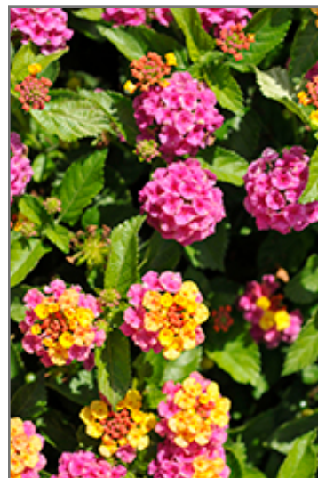
Havana Cherry Lantana flowers