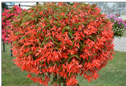
Beauvillia Dark Salmon Begonia in bloom